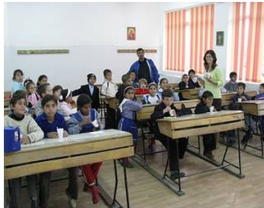
Hot Muesli to warm the stomach and help the children to study better

We were delighted to have the Eurovangelism's, Vision Trip Team spend the better part of the week in our area. We are always moved that people come 1/3 of the way around the globe to encourage us and experience first hand the needs and to see what the Lord is doing about it. Thank you team for all the new Crocs (shoes) knitted items and so much more that you brought as part of your luggage.