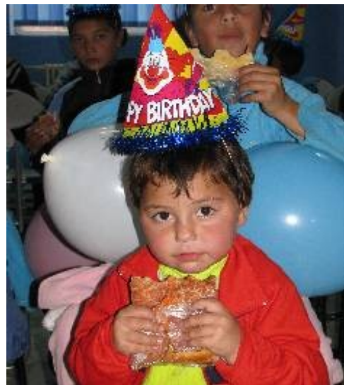
Children enjoying pizza as part of the celebration in the cultural house

Before we know it, the season to share the Love and message of Christ through shoe box gifts will be upon us. We are expecting to distribute up to 2000 of these gifts to the most needy and un-reached children in our city and three nearby villages. These shoe box gifts give us the opportunity to share the greatest story ever told; of Jesus' birth, His life and death on the cross, so that we may have eternal life through faith in Him.