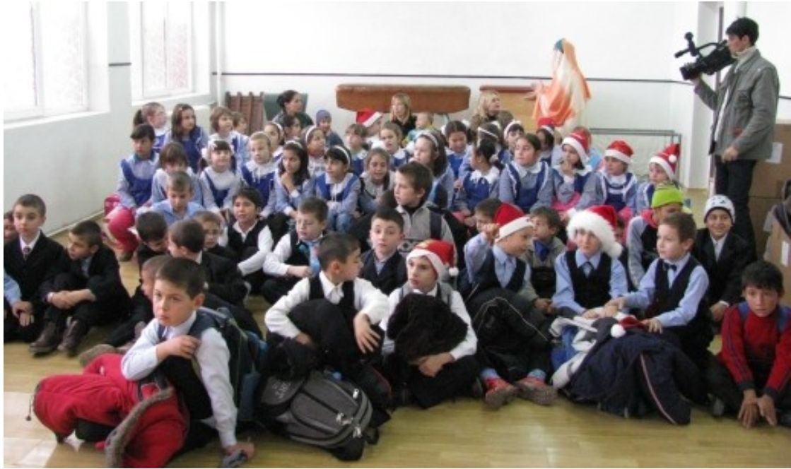
One of the many school programs, this one was televised.

The thought that someone whom we never met loves us enough to prepare us a gift and gave it unconditionally is so like the love that God has given everyone of us. We have so much to be grateful for, because you have given of your selves, shared your prayer time and finances. You precious ones have made this ministry possible to continue. Yes, you are very much among the voices that have spoken the good news and the hands and feet that have brought gifts as a token of His love, to so many children that never knew they were loved. Bless you!