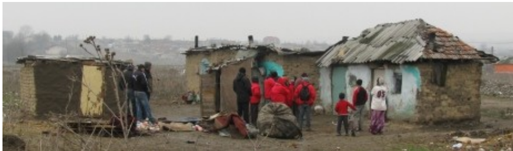
Bringing joy, love and hope to the poorest of the poor

During the past Holiday Season we had the privilege of being the voices that brought the good news and the hands and feet that brought many hundreds of gifts to needy children. During the season we were so privileged to share the wonderful story of the birth, life, death and resurrection of Jesus Christ, the gift of God's love.