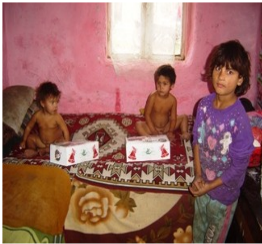
Santa never visits these homes but Jesus servants do. He was born to die to give us life