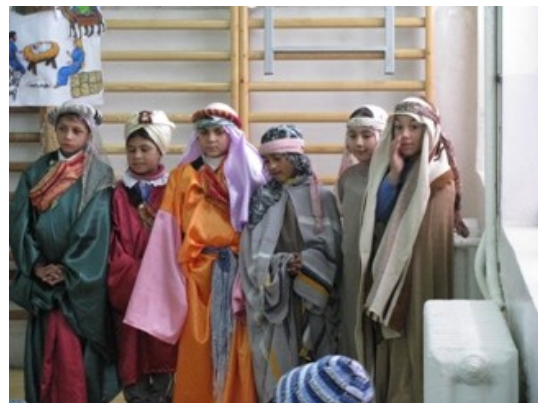
“Unto us a child is born, unto us a Son is given!”