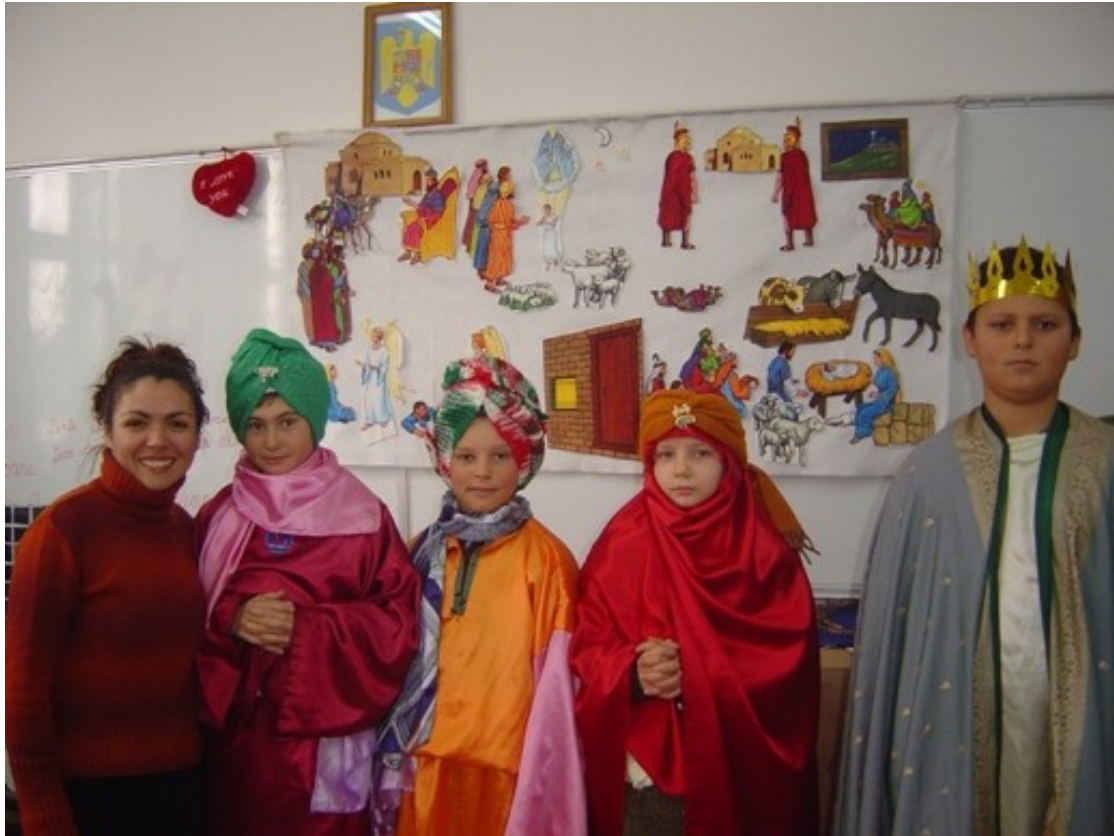
Three Magi as they showed up at Herod's door looking for the new born King