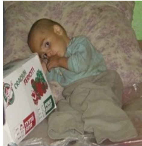
A gift of love for a very sickly child