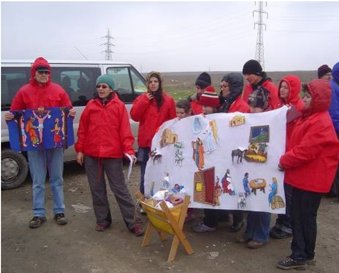
Outdoor presentation with team from Sibiu and Finland

“How lovely on the mountains are the feet of him who brings good news, announcing peace, and proclaiming news of happiness. Isa.52:7”