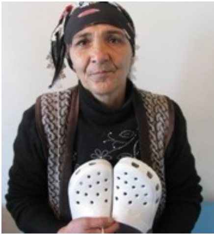
Crocs donated by Eurovangelism